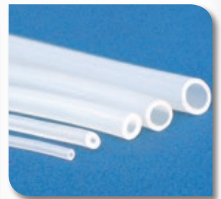
Siloflow PPI Silicone Tubing Platinum Cured, Double Network Density